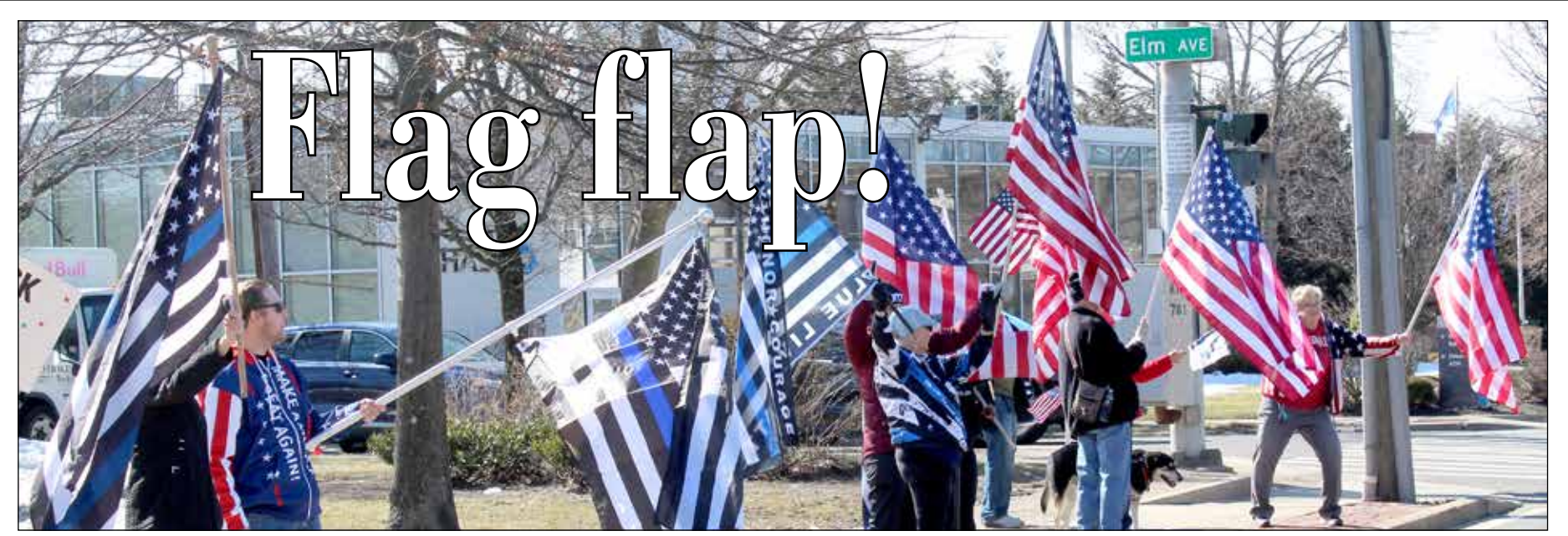
Demonstrators on Main Street in Smithtown Friday, February 26 support the Smithtown Fire Department decision to reverse an earlier determination and return a blue-line flag to the back of one of its fire trucks. See story, page 7.