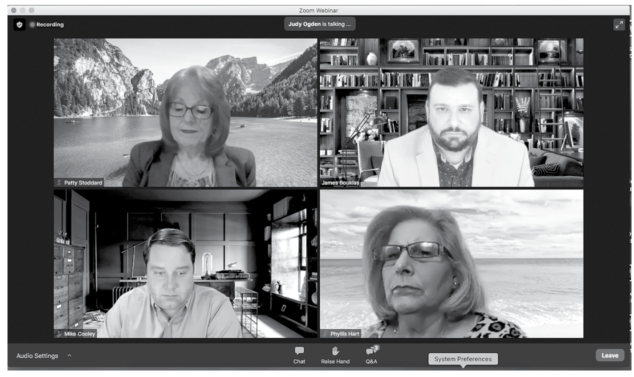
The We Are Smithtown draft master plan Zoom forum Monday, March 1

Master plan forum used to rally troops to oppose St. James development plans